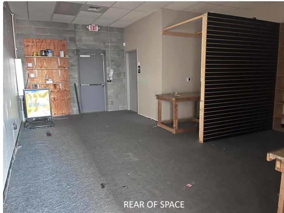
REAR OF SPACE