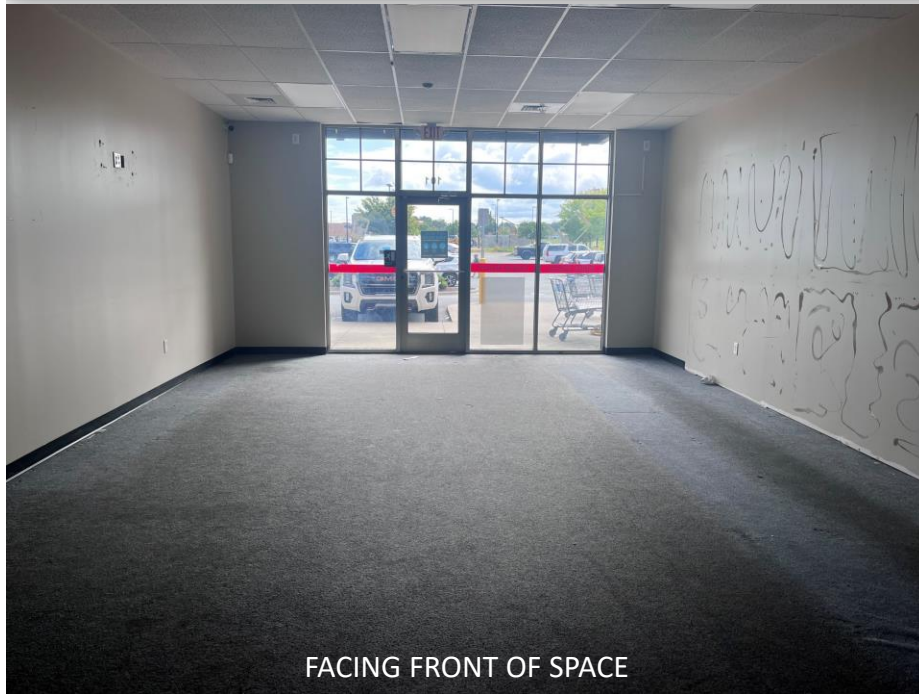
FACING FRONT OF SPACE