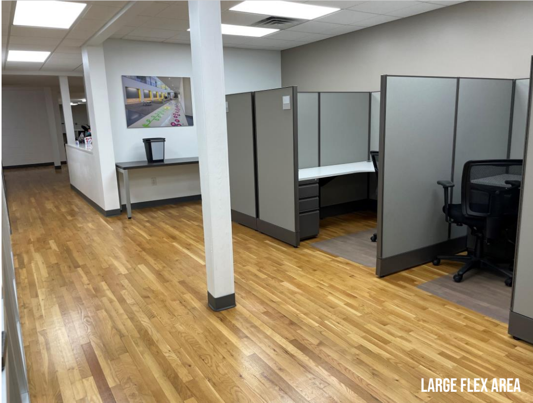
LARGE FLEX AREA