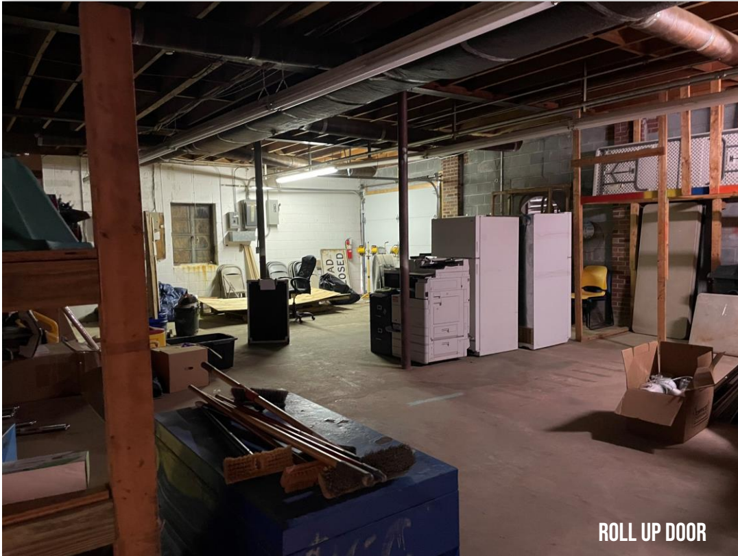
ROLL UP DOOR