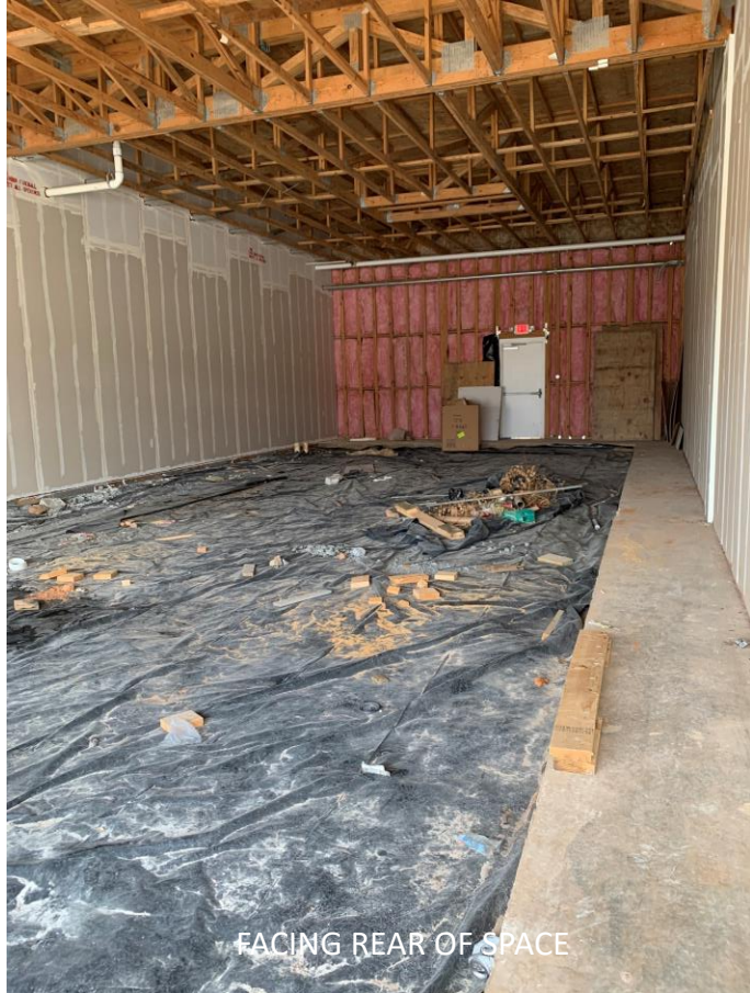
FACING REAR OF SPACE