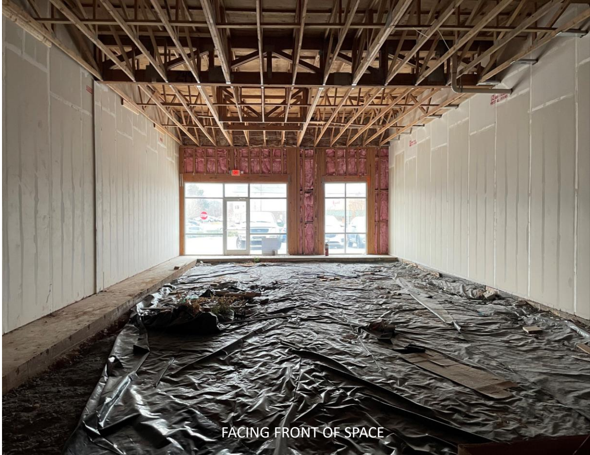
FACING FRONT OF SPACE