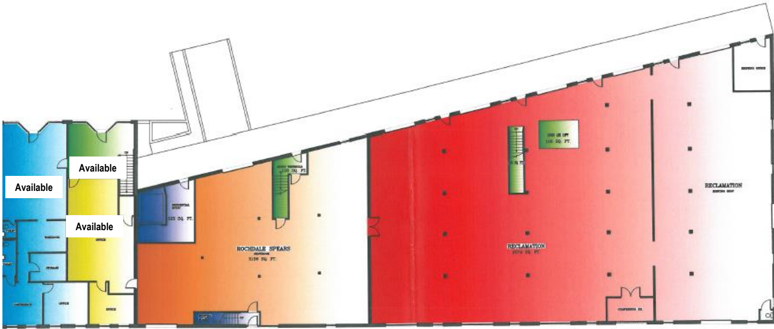
101 FIRST FLOOR PLAN A1.0

210 2 ND STREET PLACE SE HICKORY, NC 28602