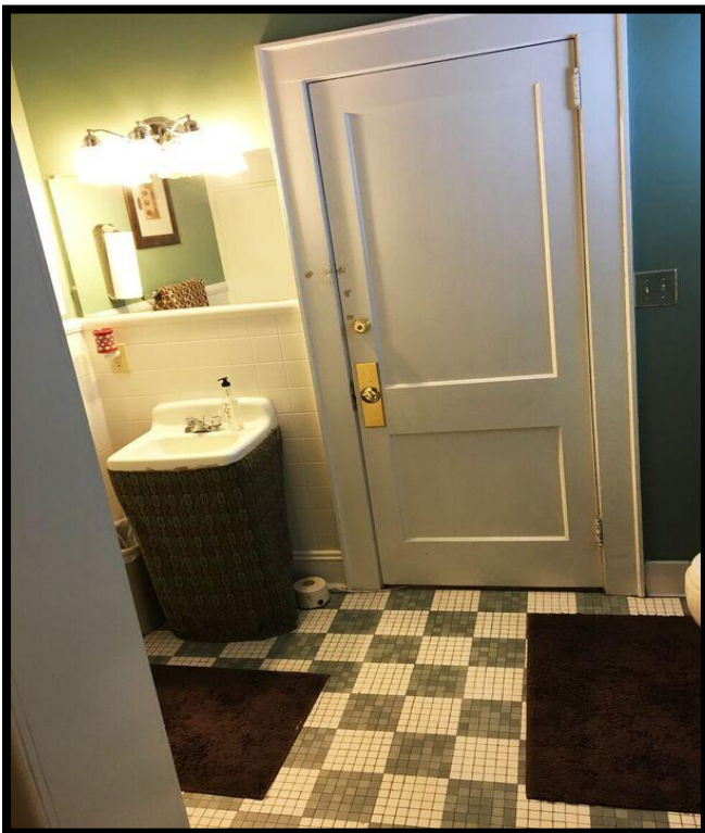
COMMON BATH (UPSTAIRS)