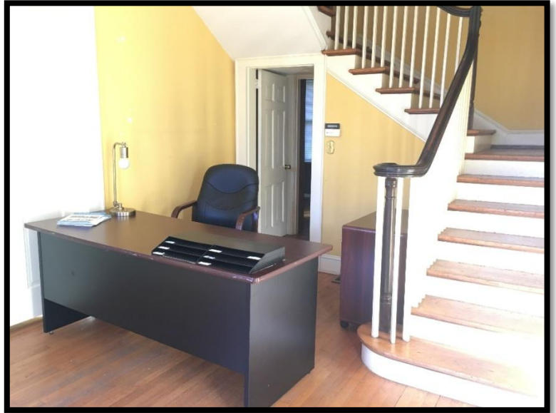
MAIN FLOOR ENTRANCE