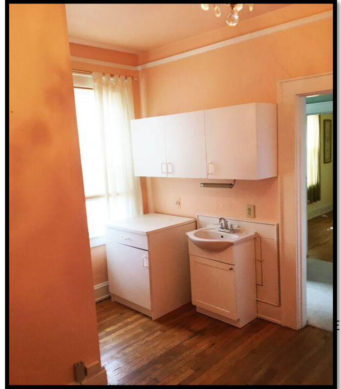
UPSTAIRS OFFICE SINK AREA