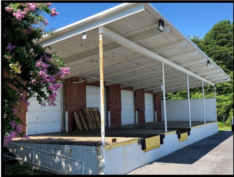
DOCK HIGH DOORS FACING NORTH