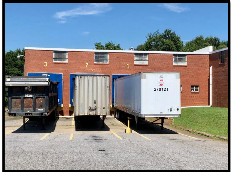
DOCK HIGH DOORS FACING EAST