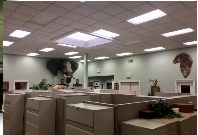
LARGE OPEN AREA